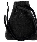
M1000 MEDICINE BAG $15.00 SIZE 3 3/4" L X 2 3/4" W