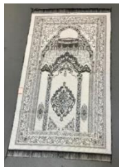
SA-001 MUSLIM PRAYER RUG $16.00