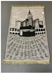
XN-005 INTERFAITH PRAYER RUG $16.00