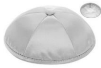
A1004 YARMULKE $5.00